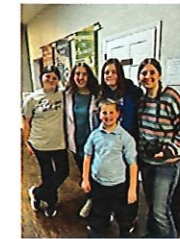
Helpers from the Toy Store Ministry